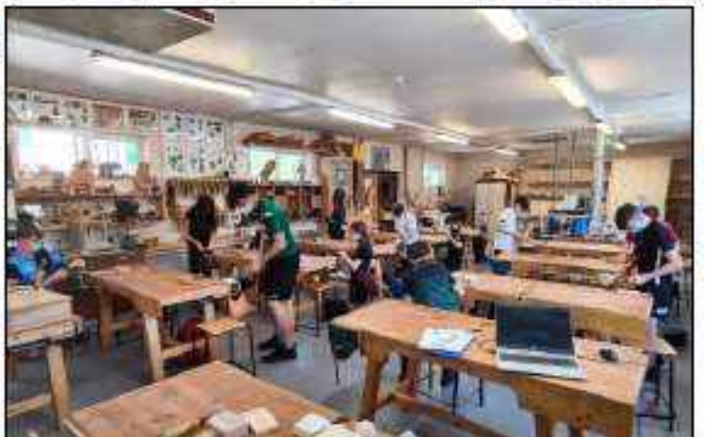
1 st years enjoying activities during the induction programme.