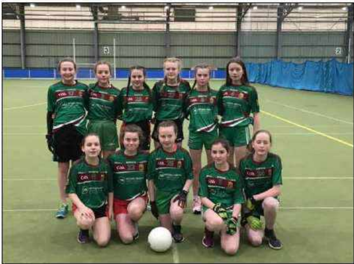
Girls indoor football.