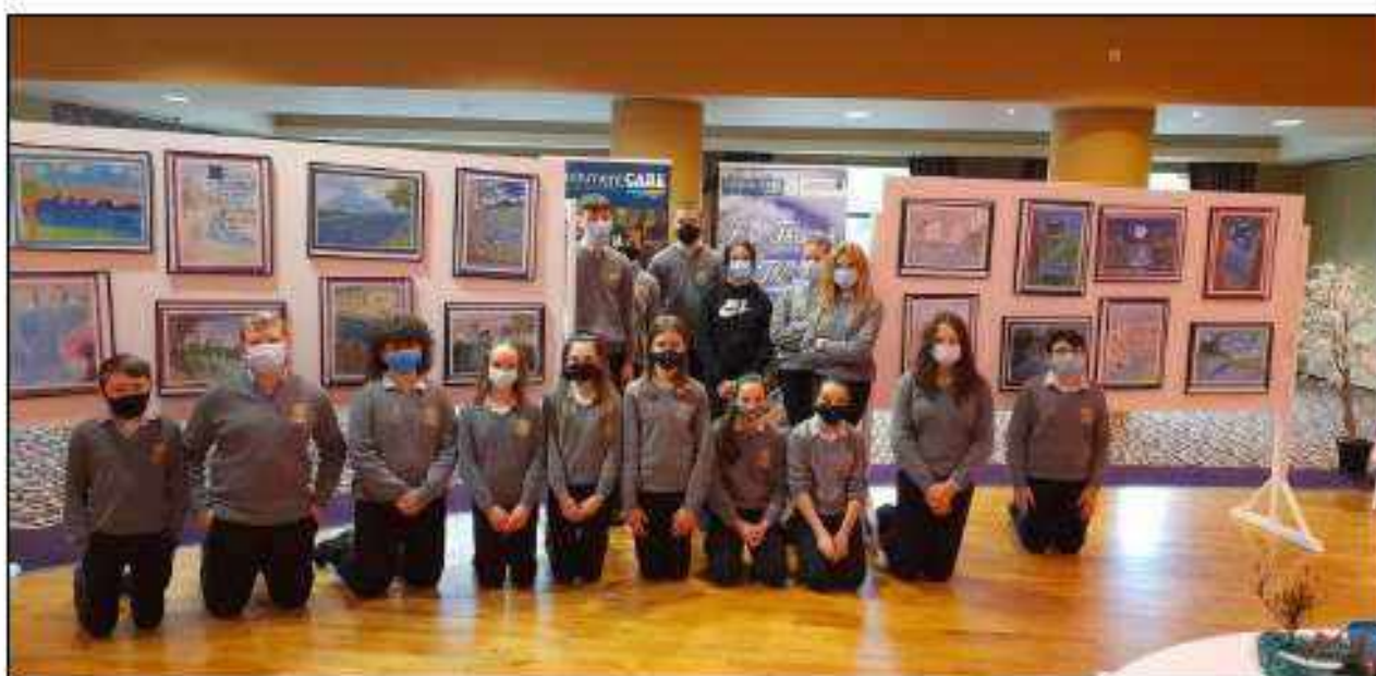
2 nd year students who had their work displayed in the "Finn through the Lens" exhibition in Jackson's Hotel.

The college offers a range of sporting activities, which includes Soccer, Gaelic, Golf, Rugby, Basketball, Athletics, Camogie, Hurling, Futsal and 'Girls Active'. In addition to the variety of sports, there are various activities and competitions in many other interest areas such as Art, Music, Business and Enterprise, Coding, Debating, Leadership, Maths and Science competitions, Field Trips, Tours, Guest Speakers and Visits Out.