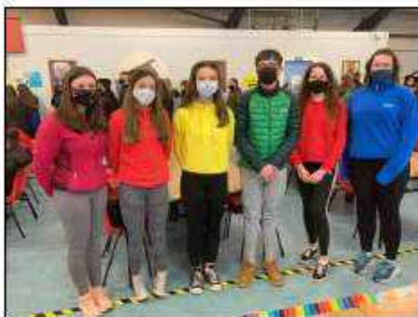
Students wearing colourful tops in support of "Stand Up" week.