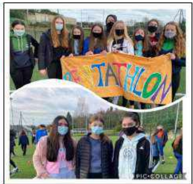
1 st and 2 nd year students enjoying activities during the Pentathlon which takes place each year.