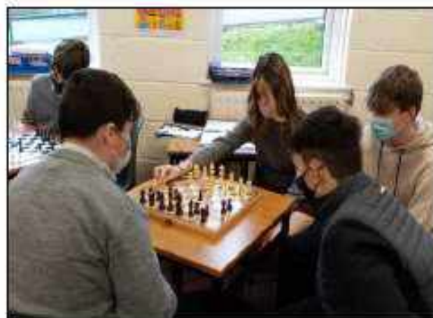
Students attending the Chess Club.