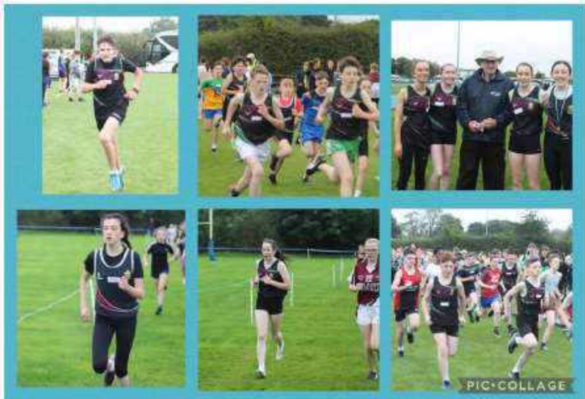
St. Columba's students competing in the Cross Country Athletics event at the Finn Valley Centre.